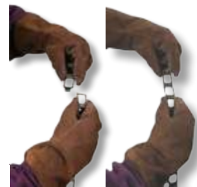
Drive Chain Links