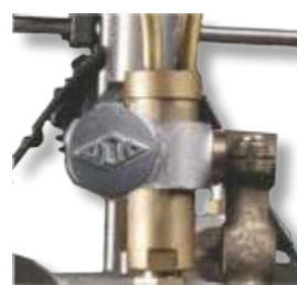
Graduated Bevel Collar